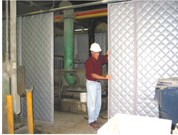
Floor mounted sound enclosure

Hydraulic pump noise is very inherent in this industrial machine. eNoise Control can offer sound proofing and sound deadening options for your hydraulic unit.