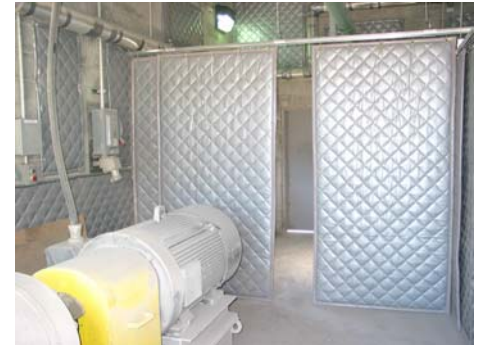
Ceiling mounted sound enclosure

The main sources of noise are the power unit (fluid pressure fluctuations), electric motor noise, and pump noise. We typically suggest sound containment using our modular sound blanket (curtain) system. The quilted blankets offer high sound control and easy access for maintenance of your hydraulic pump.