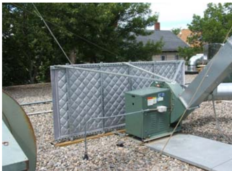
Sound Blanket Outdoor