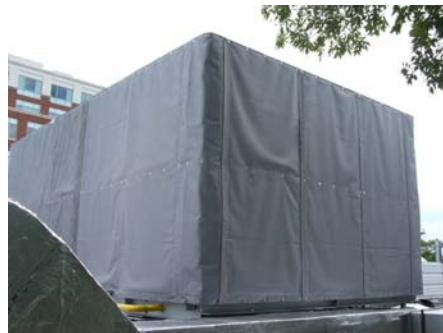
Perimeter Blanket on Fence

Unger Technologies, Inc. 297 North 9th Street Noblesville, IN 46060 Tel: (317) 774-1900 Fax: (317) 774-1911